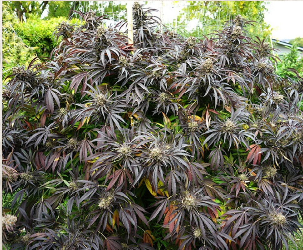
White Runtz (fast) growing outdoors

“Fast” or “Quick” cannabis seeds by Humboldt Seeds are photo-dependent strains with a fast flowering phase, which means they flower between 1 - 2 weeks faster than the standard versions. Humboldt Seeds’ Fast genetics have been created from the cross of their classic strains with their best autoflowering varieties. Fast strains are ideal for impatient growers eager to obtain quicker harvests, as well as for growers in northern areas with adverse weather conditions. Fast strains are perfect for anyone wishing to grow our classic Humboldt genetics while retaining all their top qualities — and finish in mid-September!